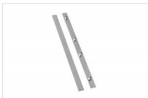
Extension set Eco/Simple